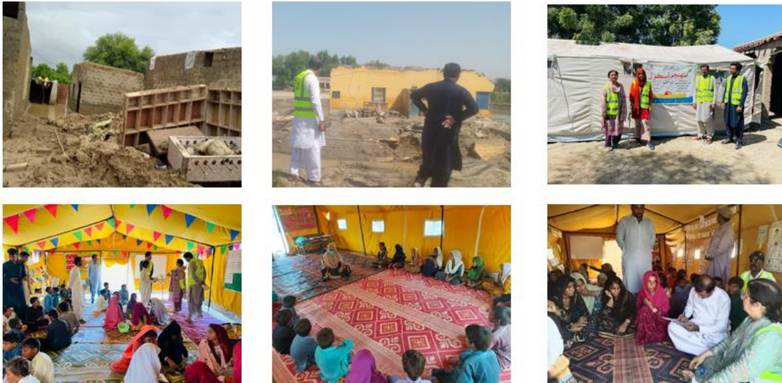
Images of Despair & Hope - Sindh Monster Floods 2022

Sindh has a population of 35 million! With more than 1.3 million households destroyed by monster floods that left almost 60% of schools damaged, millions of hectares of standing crops destroyed, and millions of livelihoods compromised, the disruption is multi-level and at scale. In this time of crisis, uninterrupted access to quality education is the right of every child. To address these challenges ITA collaborated with the School Education & Literacy Department (SELD) Government of Sindh with generous and timely support from the Foreign Commonwealth & Development Office (FCDO) to ensure that every child's foundational learning journey must continue for a learning and thriving Pakistan.